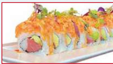
Crazy Tuna Roll