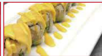
Mango Dragon Roll